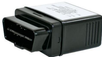
Standard OBDII Port

10600 W. Mitchell Street, West Allis, WI 53214